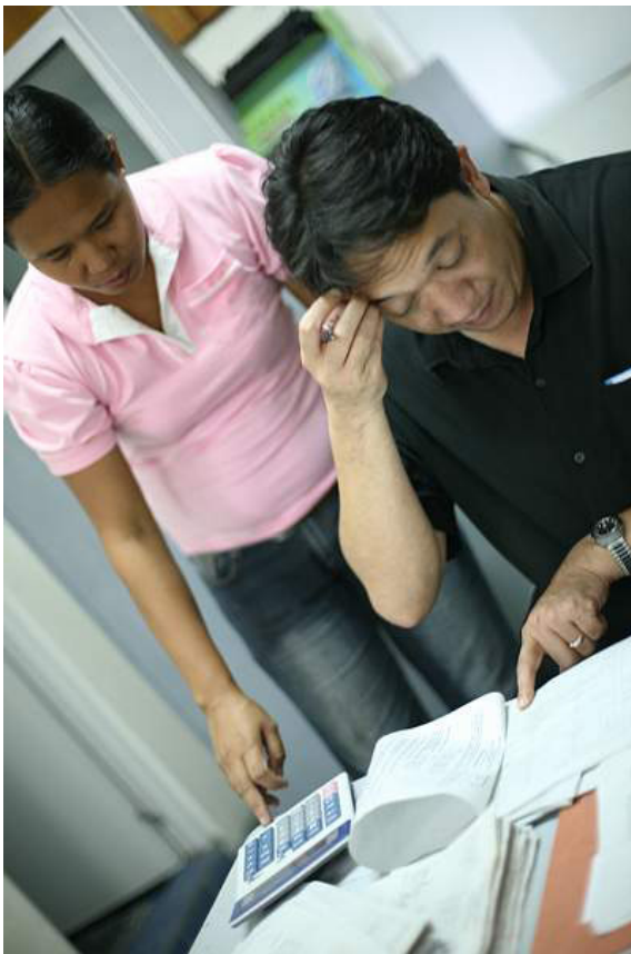
PPI scores are easily computed in the field with nothing more than a pencil and paper. Now, Gomby can easily calculate the poverty levels of NWTF’s clients.

The percentage of entering clients who were above the poverty line was higher than NWTF expected.